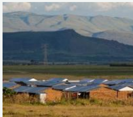
PS 5: Land Acquisition and Involuntary Resettlement