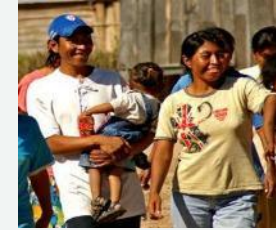
PS 4: Community Health, Safety and Security