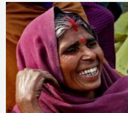
PS 7: Indigenous Peoples