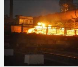
PS 3: Resource Efficiency and Pollution Prevention