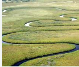
PS1: Assessment and Management of Environmental and Social Risks and Impacts