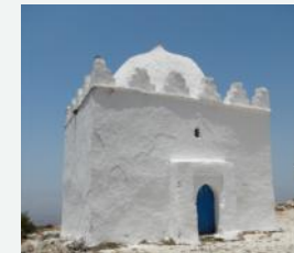
PS 8: Cultural Heritage