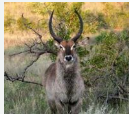
PS 6: Biodiversity Conservation and Sustainable Management of Living Natural Resources